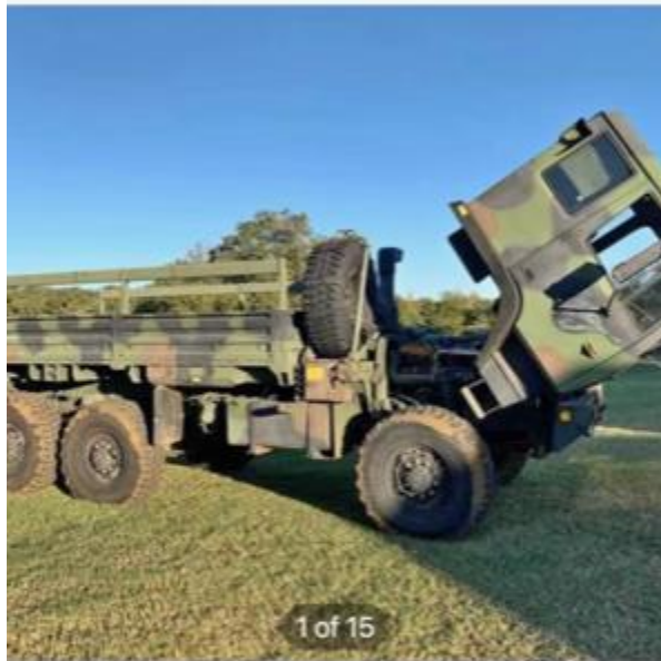
1998 Stewart & Stevenson M1083 5 Ton 6x6 $25,000 $27,000