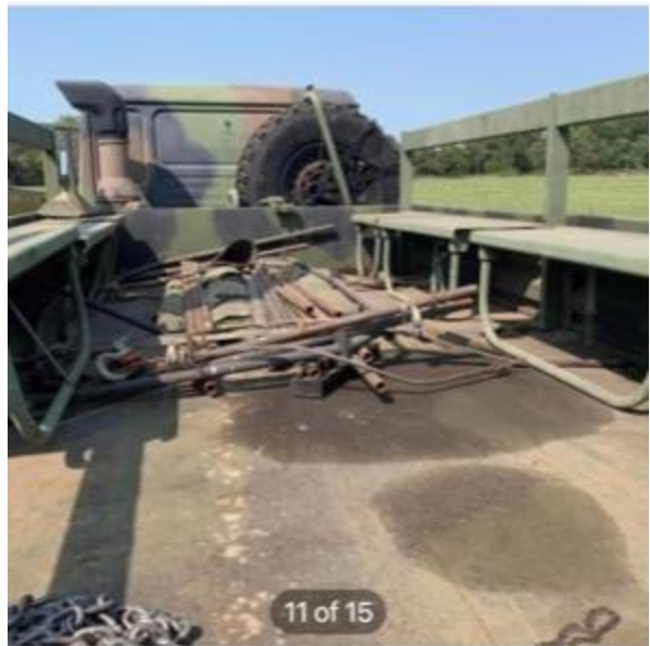
1998 Stewart & Stevenson M1083 5 Ton 6x6 $25,000 $27,000