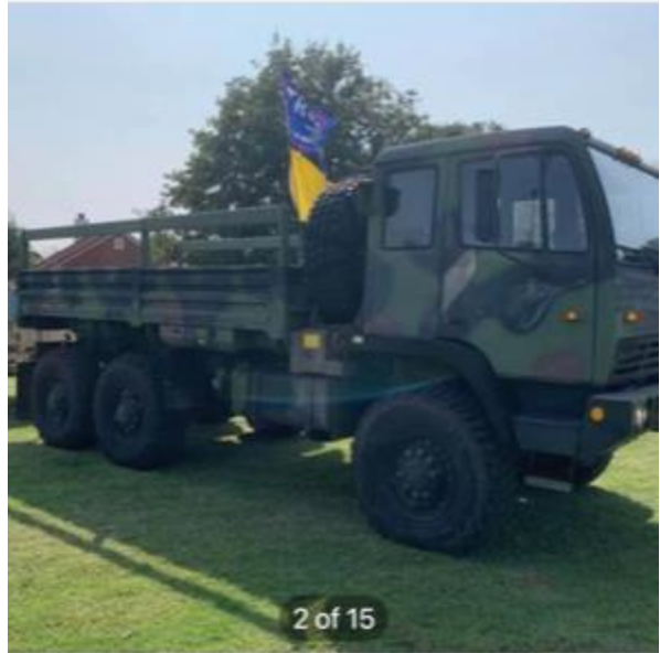
1998 Stewart & Stevenson M1083 5 Ton 6x6 $25,000 $27,000 Listed about a month ago, Woodford, OK