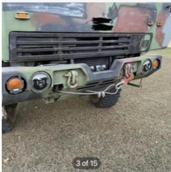
1998 Stewart & Stevenson M1083 5 Ton 6x6 $25,000 $27,000